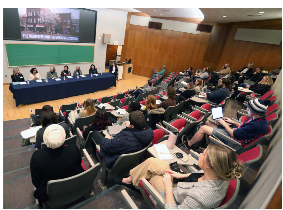
Community Gathering in Quigley Hall Auditorium

The mission of the Women in Business and Economics Club is to promote and support women in the fields of Business and Economics. By shedding light on the issues that women in these fields face, the club strives to provide valuable resources that promote academic success and engagement. We understand that meaningful change requires collective efficacy, collaboration, and empathy, which is why we invite everyone who is interested to join our organization. Together, we can promote an inclusive future for the fields of Business and Economics.