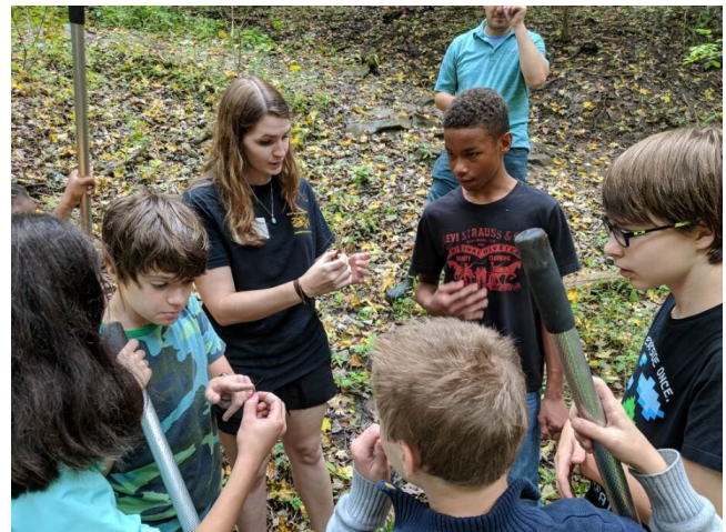
Above: St. Edmund's Academy Creek Connections students investigate crayfish from their stream with West Liberty University graduate student.