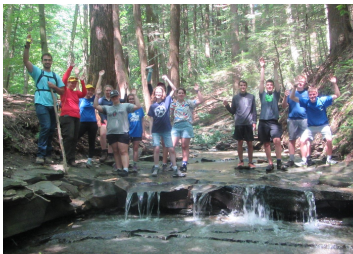
Above: Creek Campers and staff check out a stream during a tree hike.