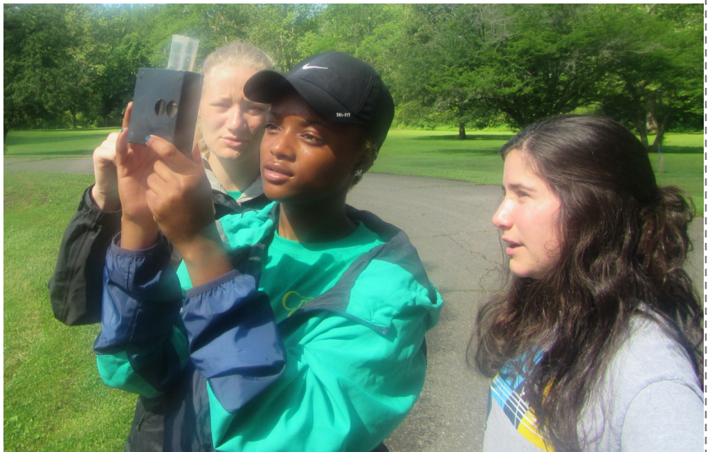
Above: Creek Campers read the amount of nitrate nitrogen in their stream sample.

Not only are nitrogen and phosphate both nutrients and similar in their role they play in our waterways, but the way we test for them at Creek Connections is also very similar. As you may have noticed, they both use the color comparator black box to determine the concentration of each compound. However, for the nitrogen test, the light is shining through the box. The light actually comes through the window in the back of the container, so be careful to not cover it with your hand while reading the scale. For the phosphate test, the light comes from above and reflects off of a mirror in order for you to compare the colors. Make sure you do not have lids on the test tubes, or else the light will not be able to shine through and you will not have accurate readings!