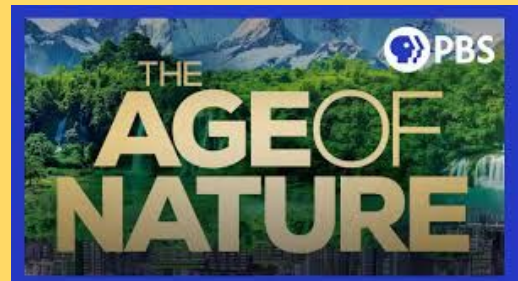
Photo taken from youtube trailer

To launch the new Age of Nature Series on WQLN-PBS, they are holding an online screening event to watch the first episode, Wednesday October 7th. Go to www.WQLN.org/Nature to register!