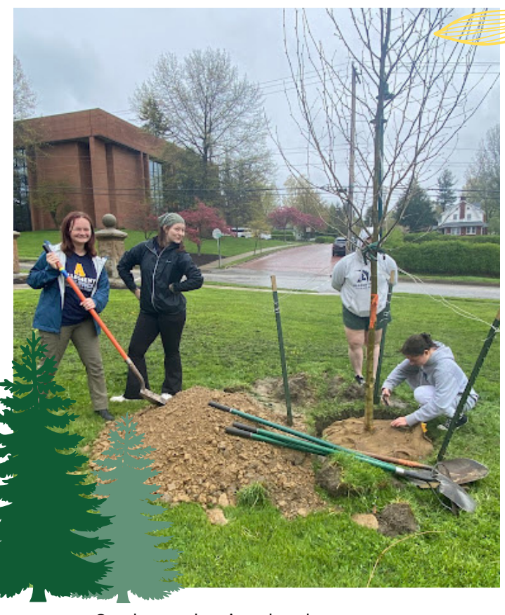
Students planting the chestnut tree.