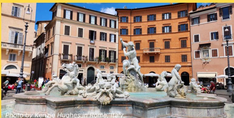
in Rome, Italy