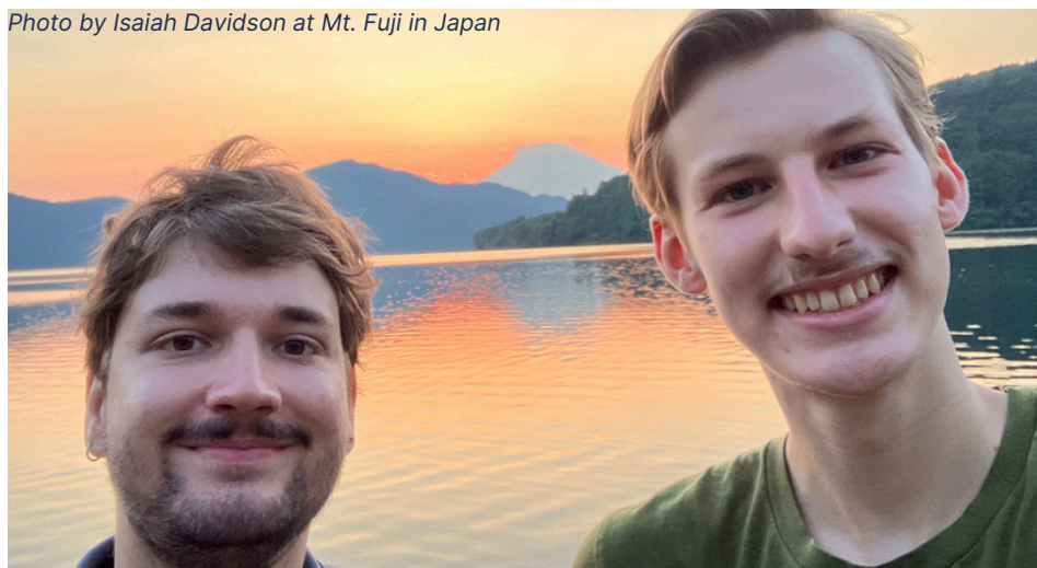
at Mt. Fuji in Japan

Q: What is one thing you learned about yourself while studying abroad?