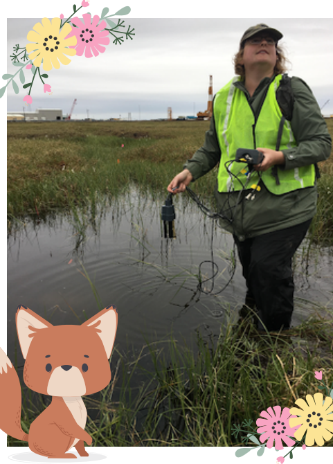
Sampling ponds in Prudhoe Bay, Alaska